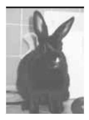
Moe is a dainty, shy sweetheart who spent 4 of her first 10 months of life living at the SPCA. Now that she's in a foster home, she's eagerly learning to be handled and loved. if the white smudge on her nose doesn't win your over, her tendency to nuzzle into your neck will.

Max is an energetic little guy who likes to have his head rubbed, shred newspaper, and run around.