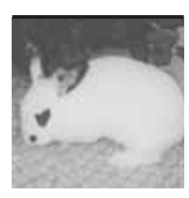
Patches is a sweet 5 lb. Hotot boy who is friendly, mellow and likes to be picked up.

Alexander is a young white angora mix who was also among the Fair Oaks rescues. HRS took him because he was injured; he's now made a full recovery and follows his human roommates around the house. He has a curious streak that gets him into amusing predicaments, is absolutely fearless and loves to be the center of attention.