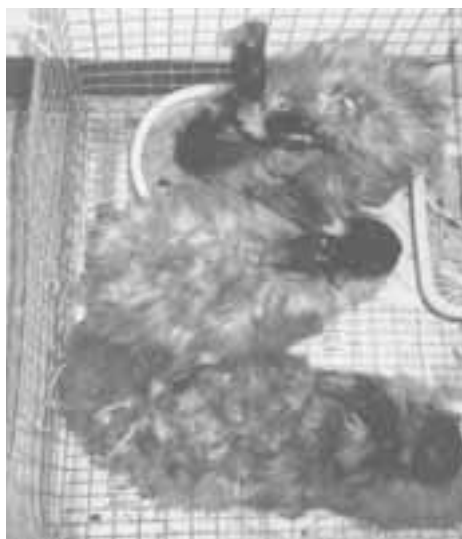
Most of the adult rabbits had tattered ears and other wounds from fighting. These Angoras also had matted coats.