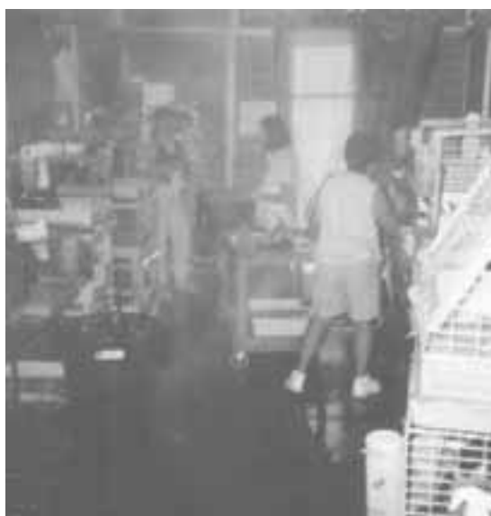
Left: Volunteers put in long hours at the barn, using overhead misters and a donated swamp cooler to beat the heat, which reached as high as 109°.