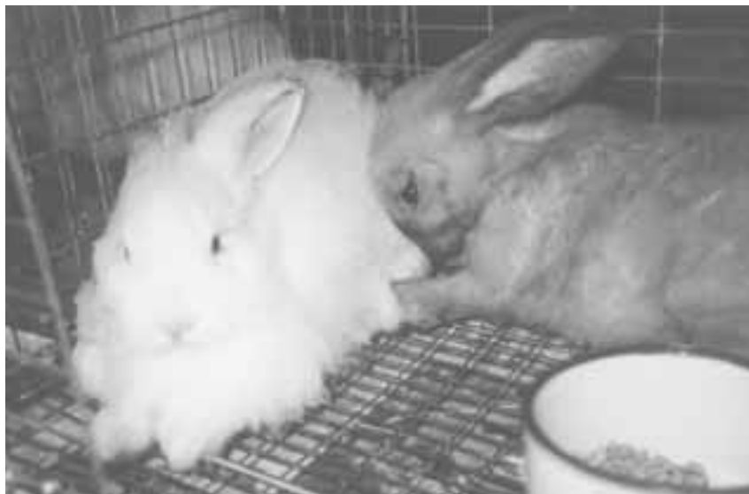
Top: Because these rabbits are used to communal life, our goal is to adopt out in same-sex pairs or triples whenever possible.

In the meantime, as an organization, we need to implore our members to support us in this very important mission. Many have sent in monetary donations earmarked for the cause – those donations enabled us to purchase, among other supplies, nice, new cage banks for the rabbits in the barn, replacing the dilapidated cages that housed the buns for the first few scary nights. We are still accepting donations, which may be sent to Sacramento House Rabbit Society, PMB 48, 2443 Fair Oaks Blvd, Sacramento, CA 95825-7684. Write “SPCA rabbits” on the memo line.